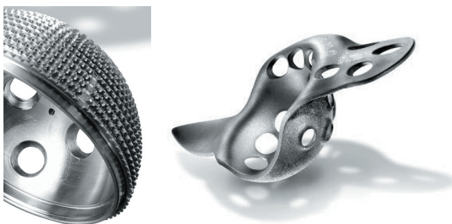
Fig. 1: Macro-structured shell for acetabular cup for cementless primary implantation (left) and an acetabular roof cup for revision surgery (right).

HYBRIDMANUFACTURING™ refers to an intelligent combination of deep drawing and machining processes, designed to ensure that flat material is formed as near to net-shape as possible, so that only minimal processing is required. Unlike casting and forging, which always have to be done at the start of the process chain, forming using HYBRIDMANUFACTURING™ is subject to no such restrictions. Examples of this can be seen in Fig. 1: firstly, the basic form is produced from a titanium sheet. The subsequent stages involve embossing the macrostructure or incorporating shaped structures, such as screw holes.