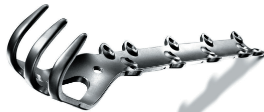
Fig. 3: Fracture plate, formed near net-shape in a multi-step forming process.

Pure titanium (all grades), titanium alloys, CoCr alloys and high-alloy medical steels are all suitable for forming.